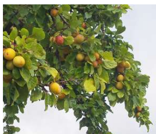
Warwickshire Drooper – Makes some of the finest Plum Conserve and are delicious straight from the tree

This variety was grown commercially by orchards in Warwickshire and the surrounding areas and was initially believed to be known as the Magnum. This is not certain because, in the Midlands, there are several plums trees containing the name Magnum. What is certain however, is that in the 1940s it became known by its current name – the Warwickshire Drooper. When grown in commercial orchards this variety was typically grown on its own roots which made for a very large tree. To propagate the trees they would cut away